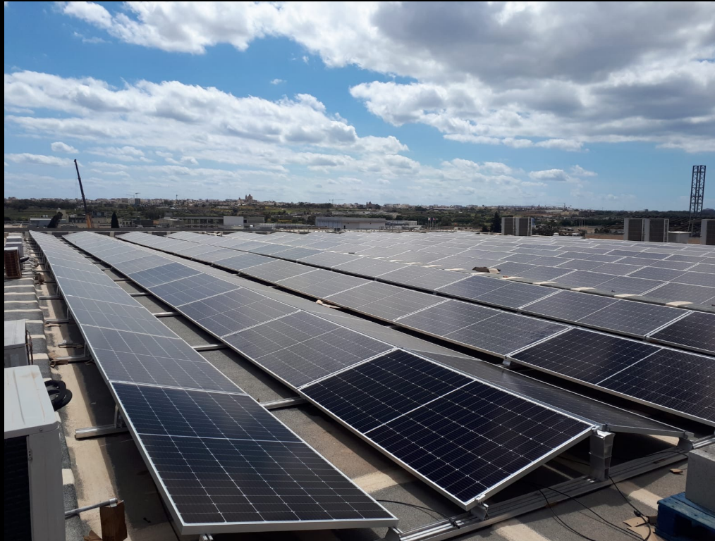
Blueshape manufacturing factory, Malta